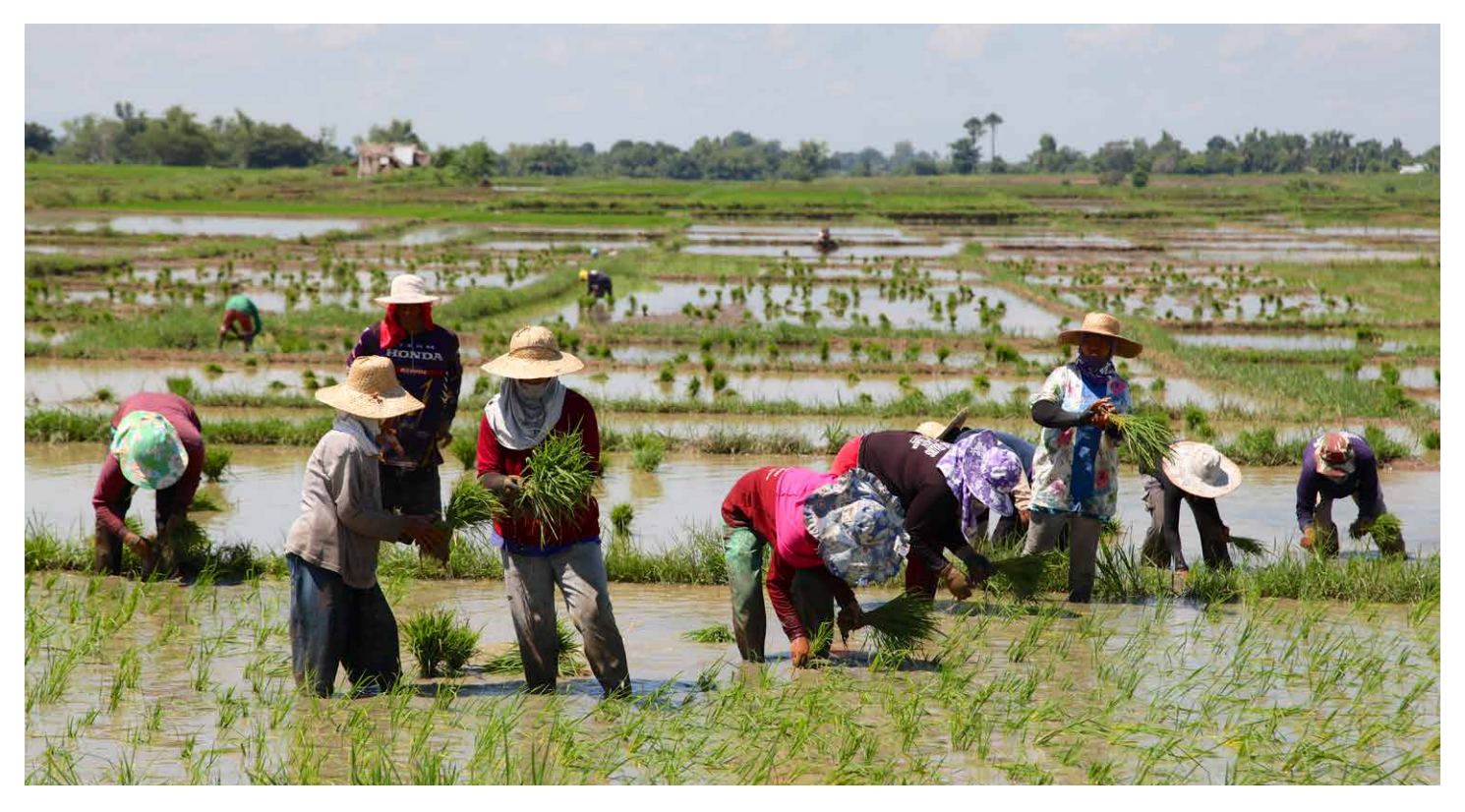
Agriculture continues to be the largest consumer of water with little consideration of its impact on water for other uses.