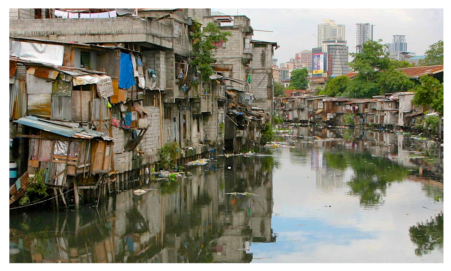
AWDO 2016 highlights a growing gap between rich and poor in accessing clean water and sanitation in Asian cities.

The new edition of the Asian Water Development Outlook (AWDO 2016), 1 charts progress in water security in Asia and the Pacific over the past 5 years. Overall, the region shows a positive trend in strengthening water security since the previous edition of the report in 2013, 2 when 38 out of 49 countries were assessed as water insecure. In 2016, the number has fallen to 29 countries.