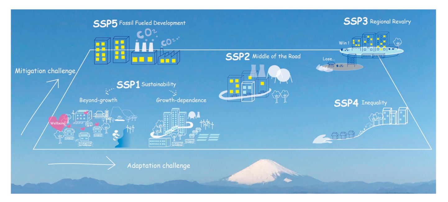
Figure 1. SSP alternative pathways, describing each scenario assumptions as 'pattern languages' inspired by C. Alexander [44].