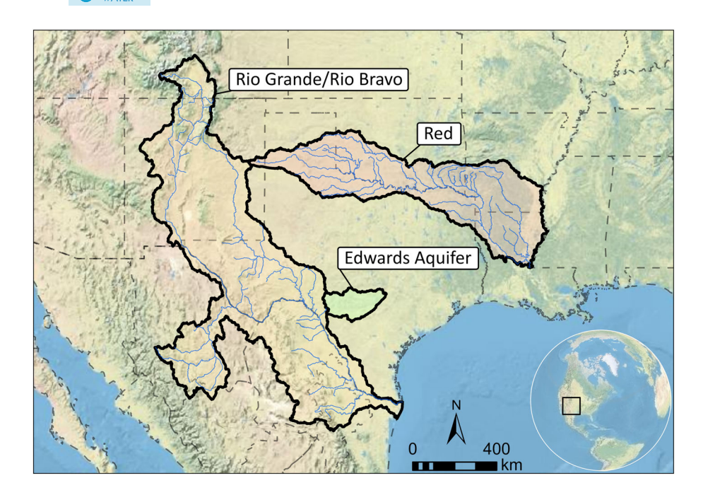
FIGURE 1 Our case studies cover two major river basins and one large aquifer in the South-Central United States and Northern Mexico