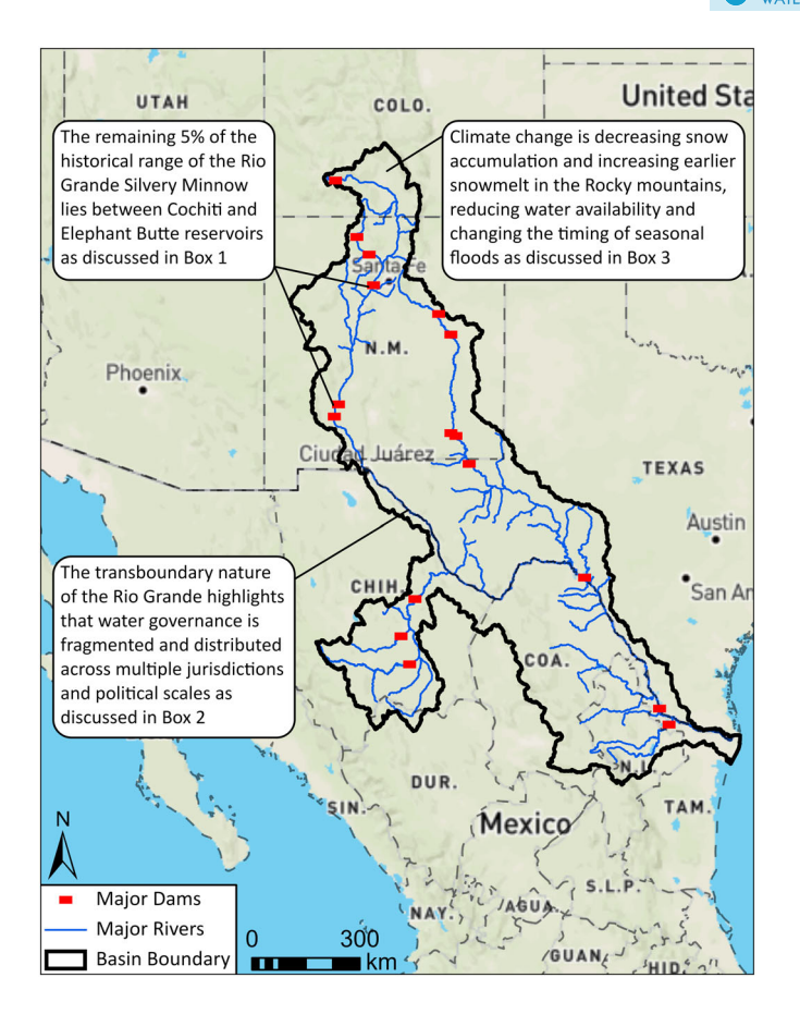
FIGURE 3 Map showing the major features and case study topics in the Rio Grande/Rio Bravo river basin