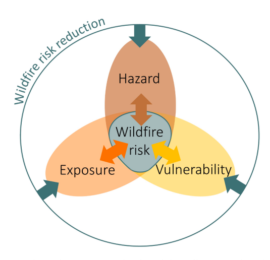
Fig. 1. Wildfire risk as the interaction between hazard, exposure and vulnerability. Illustration based on the risk framing in O'Neill et al. 2022, Figure 16.1. Arrows between wildfire risk and hazard, exposure and vulnerability indicate the socioeconomic dynamics determining the size of each risk dimension and the impact on shaping risk. Green arrows illustrate that risk can be reduced from measures encompassing all risk dimensions.

An understanding of vulnerability and its links to local social, institutional and economic factors is key to wildfire risk adaptation (Rego et al., 2018). The transformation towards effective wildfire risk adaptation in an uncertain future will have to acknowledge and address underlying social and economic conditions determining differential vulnerabilities in the context of wildfires (McWethy et al., 2019; Schinko et al., 2023). In turn, this would require a shift towards a more inclusive and transparent engagement of those groups most at risk to work towards an even distribution of risk (Essen et al., 2022). During recovery and adaptation, insurance can serve as a solidarity mechanism (Schinko et al., 2023), yet, increasing wildfire occurrence is compromising insurance availability or affordability (OECD, 2023), threatening livelihoods and raising issues of asset stranding (Caldecott et al., 2021).