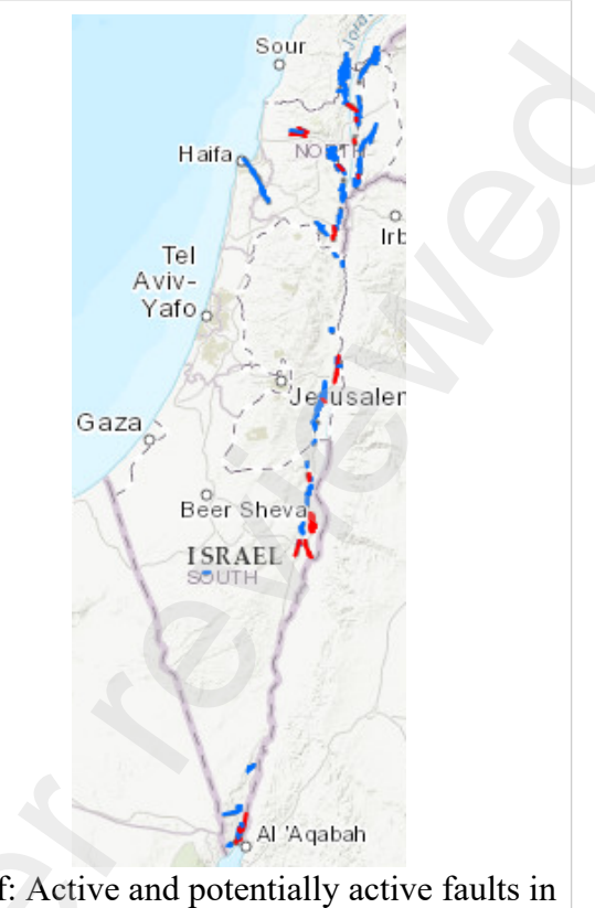
Fig 1f: Active and potentially active faults in Israel [Geological Survey of Israel: https://egozi.gsi.gov.il/WebApps/Hazards/A ctiveFaults/]

[http://seismo.ethz.ch/export/sites/sedsite/ea rthquakes/.galleries/img_maps/RZ_ERM_Ri skmap_EN_1200px_WEB.jpg_2063069299. jpg; 17.3.2023]