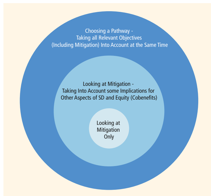
Figure 4.1 | Three frameworks for thinking about mitigation.

The second justification is the legal claim that countries have accepted treaty commitments to act against climate change that include the commitment to share the burden of action equitably. This claim derives from the fact that signatories to the UNFCCC have agreed that: "Parties should protect the climate system for the benefit of present and future generations of humankind, on the basis of equity and in accordance with their common but differentiated responsibilities and respective capabilities" (UNFCCC, 2002). These commitments are consistent with a body of soft law and norms such as the no-harm rule according to which a state must prevent, reduce or control the risk of serious environmental harm to other states (Stockholm Convention (UNEP, 1972), Rio declaration (United Nations, 1992b), Stone, 2004). In addition, it has been noted that climate change adversely affects a range of human rights that are incorporated in widely ratified treaties (Aminzadeh, 2006; Humphreys, 2009; Knox, 2009; Wewerinke and Yu III, 2010; Bodansky, 2010).