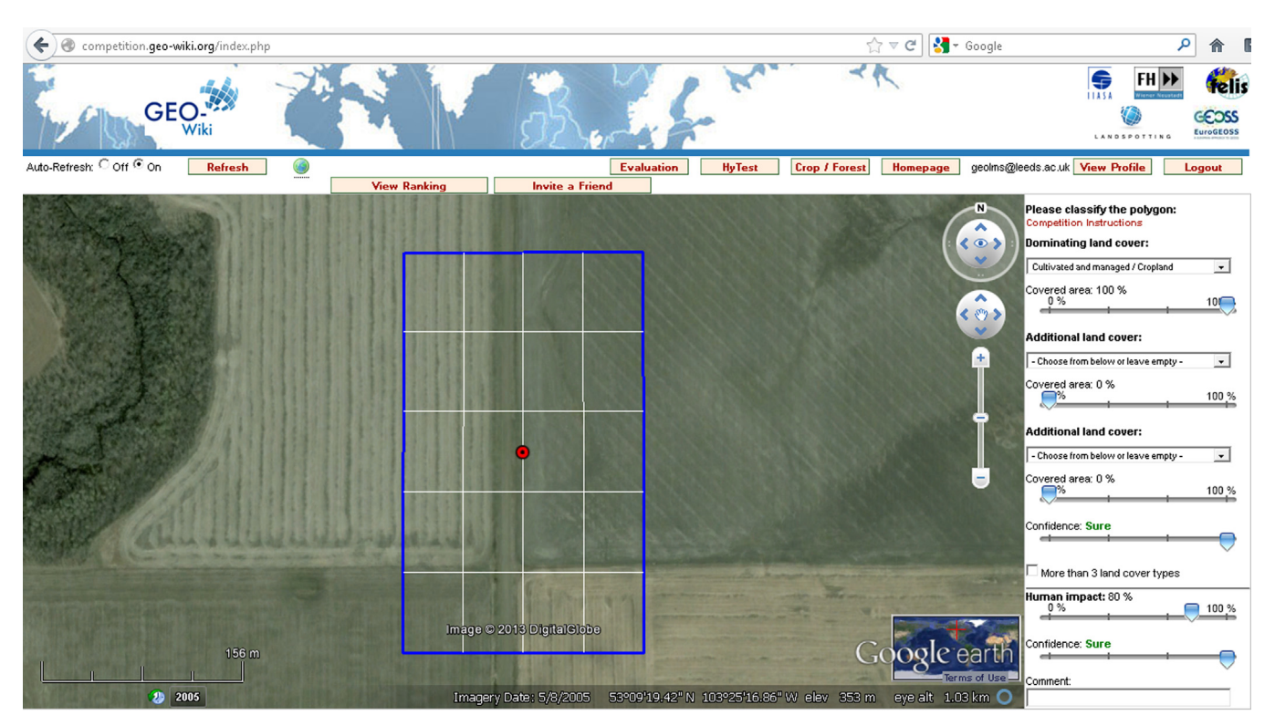
Fig. 1. Screenshot from the Geo-Wiki crowdsourcing tool for collecting information on land cover across the globe.