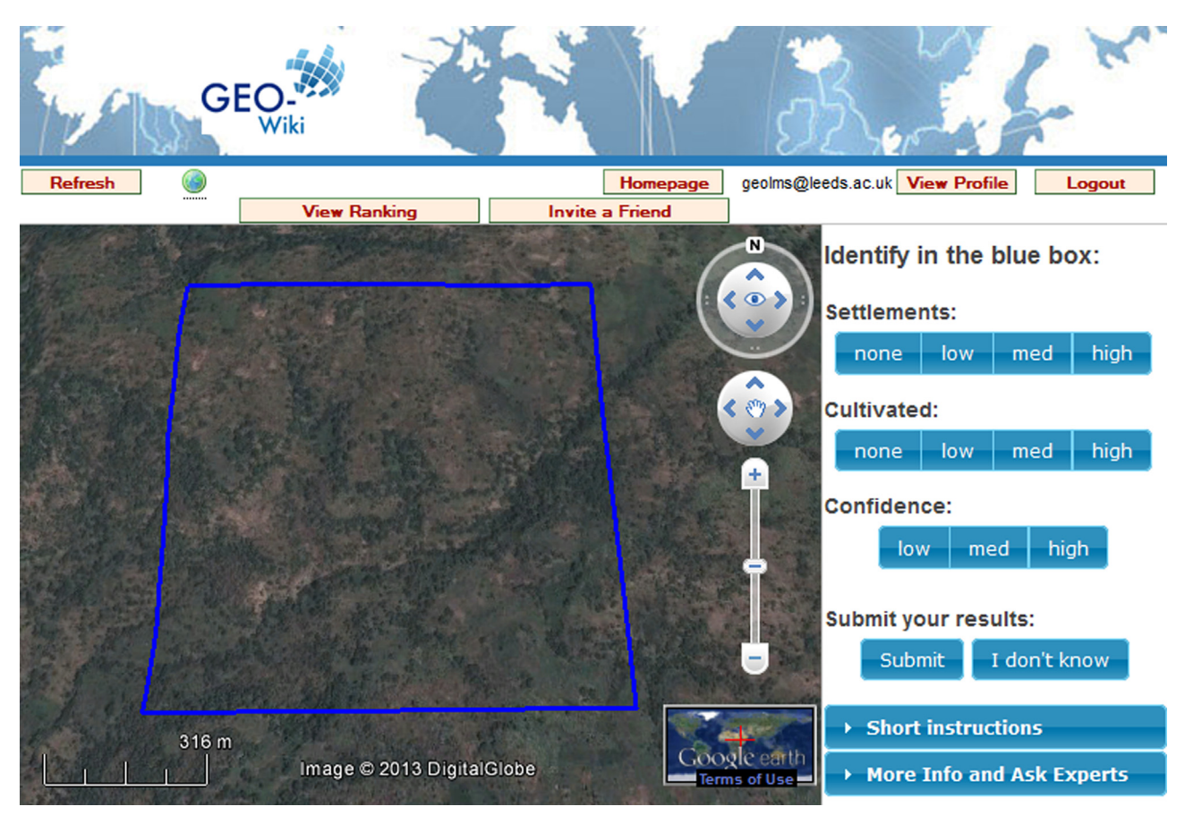
Fig. 2. Screenshot from the Geo-Wiki crowdsourcing tool for collecting information on degree of cultivation and degree of human settlement in Ethiopia.

ground in Ethiopia. Participants were provided with examples to help train them, a facebook site was set up to discuss images that were difficult to classify, and each area classified was provided to