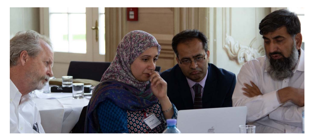
Figure 11: Participants engage in the marketplace roundtables