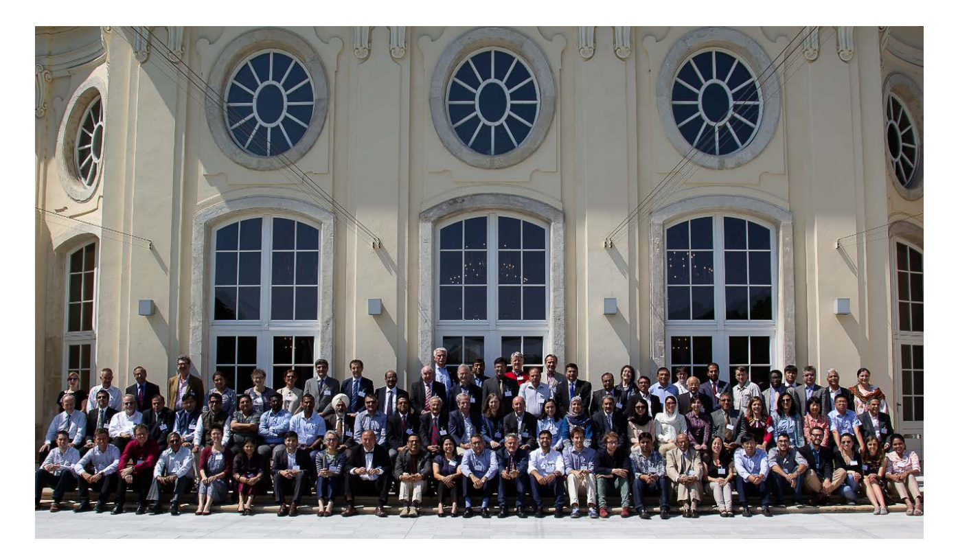
Figure 1: Group Photo - Participants of the 3rd IBKF, Laxenburg, Austria

The IBKF aims to further strengthen the connections amongst those working in policy making, research and knowledge generation in the Indus Basin