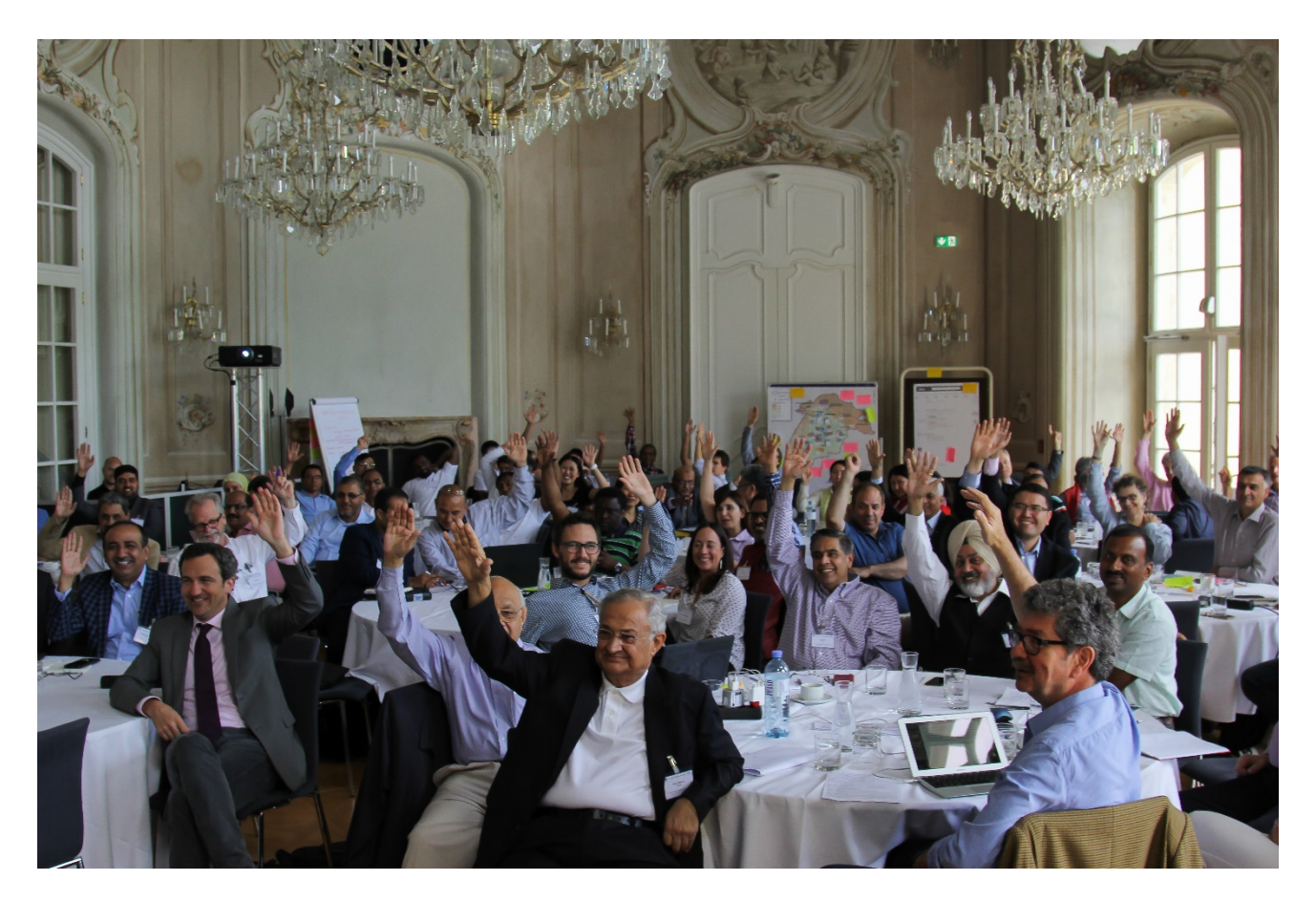
Figure 8: Participants in action

formally designated as capacity development. Some agencies have dedicated resources to fund knowledge exchange. Agencies with several projects in the Indus basin, or with projects in other river basins, were in a good position to support exchange among scientists and others to promote good practices.