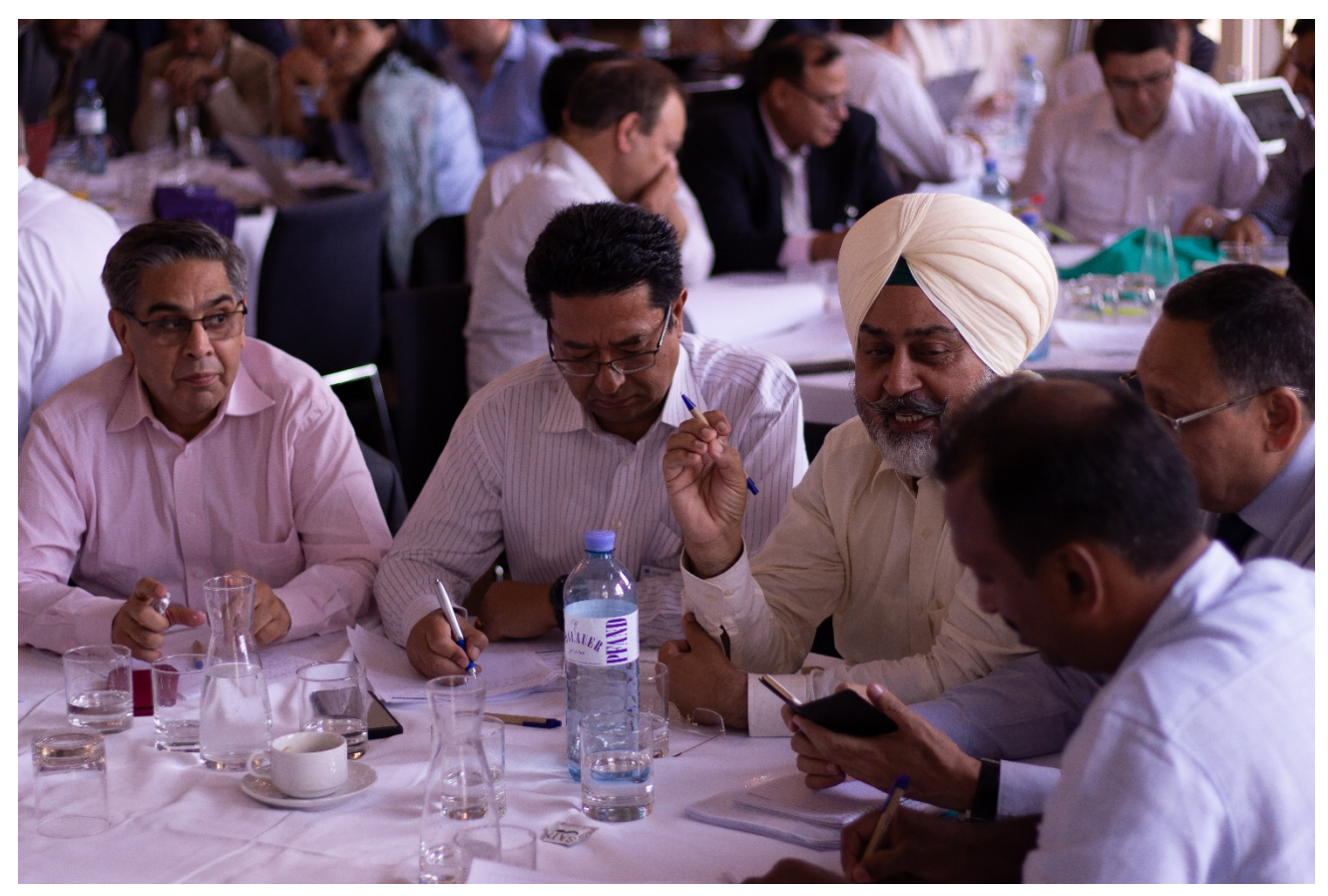
Figure 5: Participants discuss the 10 action points in a breakout session

Most groups supported the idea of a Centre of Excellence (CoE) as a means of promoting and coordinating other action points. Some felt the CoE should have a physical presence, while others preferred a virtual organisation. There was support for the transformation of the IBKF into a CoE by the addition of a small secretariat and ongoing funding. One role for the CoE would be to coordinate existing research in the four riparian countries, helping to foster collaboration among institutions and ensuring that data are of a high standard and relevant to the needs of policy makers. More frequent meetings, perhaps in the basin, would speed the process of scientific and political acceptance.