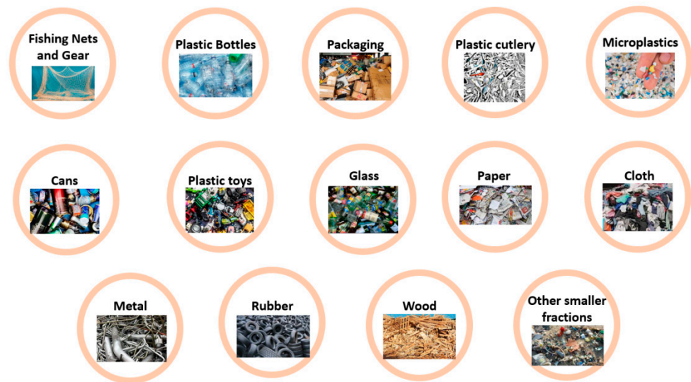
Figure 2. Overview of some of the components of garbage patches.

This is a review study, which attempts to provide an overview of the trends related to marine plastic pollution, taking into account the paucity of precise data related to increases in the sizes of the gyres.