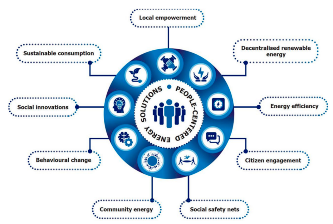
Figure 2. The role of people in bridging different elements of sustainable energy transitions [9].

Similarly, the energy transition is leading to and is spurred by various forms of social innovation (i.e., ideas, products, services, or models) that meet social needs and create new collaborations [135]. Examples relevant for the energy transition include energy cooperatives, energy "prosumers" consuming and producing energy, citizen science applications, living labs, and new participative forms of decision-making, such as citizen assemblies and local energy fora [136,137]. Figure 2 illustrates the role of people in enabling sustainable energy transitions.