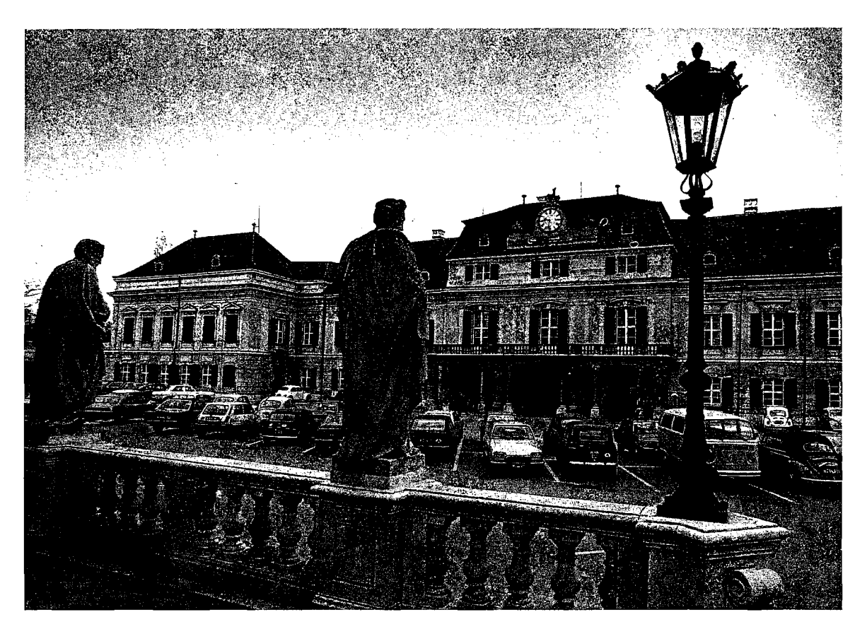
Front of Schloss Laxenburg, the home of IIASA

IIASA officially initiated its water resources research program some eight months after its birth. The founders of IIASA recognized that improvements in water resources management are essential to successful sustained regional development and the quality of human life. They also believed that a systems approach could aid those involved in water resources development, planning and management.