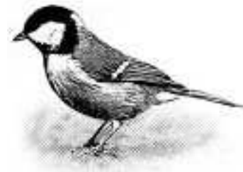
Great tit Parus major

To maintain and restore the evolutionary potential of ecosystems that persist in areas heavily impacted by human activities, evolutionary conservation biologists should seek ways to harness the forces of evolution to their advantage. Rarely has this been attempted so far (Ewald 1994, p. 215; Palumbi 2000), although encouraging examples come from virulence and pest management, on the basis of a fruitful dialogue between theory and practice (Dieckmann et al. 2002). A striking example is provided by the use of chemical control in which resistance includes a severe metabolic cost, and so makes resistant organisms less fit when the chemicals are removed (McKenzie 1996; Palumbi 2001). Methods currently used to achieve successful virulence management impact all three factors that drive evolutionary change: variation in fitness-related traits (e.g., in human immunodeficiency virus 1 by limiting the appearance of resistance mutations; Wainberg et al. 1996), directional selection (e.g., by varying the choice of antibiotics over time, Lipsitch et al. 2000), and heritability of fitness-related traits (e.g., by artificially increasing the proportion of individuals without resistance alleles; Mallet and Porter 1992). However, seldom have all three evolutionary factors been manipulated in the same system, and seldom has the engineering of the evolutionary process been attempted in a systematic fashion. In this vein, recent experimental work on selection